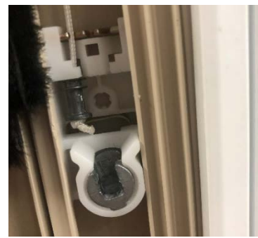
When bobbin is attached