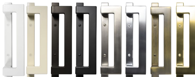
White, Tan, Dark Bronze, Black, Brushed Nickel, Brushed Chrome, Antique Brass, Polished Brass