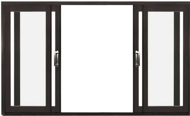
4-panel Quad Slider